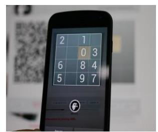
b) Keyboard on smartphone