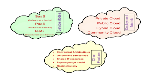
Fig 2: Illustration of Cloud Service Models, Development Models and Cloud Features

There are several implementation of cloud computing through the use of various cloud service and cloud deployments models. The three basic service models include provisioning of Infrastructure as a Service (IaaS), Platform as a Service (PaaS) and Software as a Service (SaaS). Deployment models deal with the manner in which the infrastructure of Cloud Computing system is deployed, owned and managed by the service providers & consumers. This leads to the concept of Private, Public, Community and Hybrid cloud architectures [24]. These basic concepts of Cloud Computing system are summarized in Fig. 1.