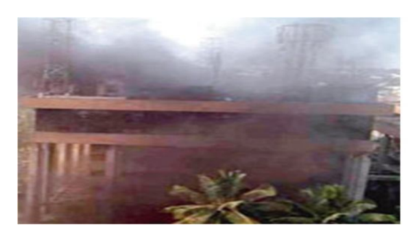
Photo shows the engulfing smoke and toxic substances from basement to top floor.

Reasons for lives losses: Three people jumped from the higher floors. Nine people lost their lives by breathing problem, due to smoke with toxic substances inhale ration.