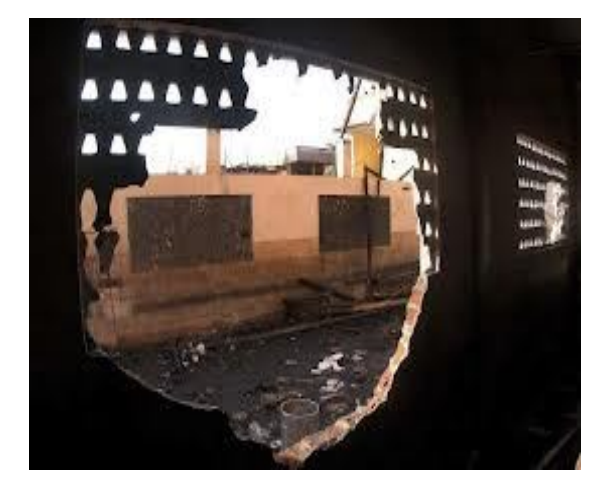
This photo shows the unshaped openings in the walls, which were created to take out the corps of the children.

Failure aspects: Provision of minimum requirements of fire fighting appurtenances, water facility, preparedness, knowledge about fire, the passive provision of site set back, escape routes, and disaster management by the staff.