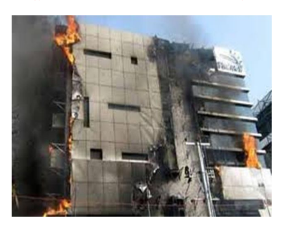
This photo shows the fire flames and the smoke reaches from basement to all the upper floors (spot photo)

Fire spread: The building having basement, ground + six floors. All doors, windows, exterior finishes are constructed by glass materials. The exterior glasses are not opening or breakable. The fire sprinkler, fire smokers, vent opening on the top are not provided. As soon as the fire started due to combustible materials in all floors thick density of dark coloured smoke, fumes and toxic substances produced, it starts to move basement to upward direction along with the fire flame. Chucking out of smoke from building to outside took four hours after breaking the glasses by the fire professionals. The fire spread was very high in the building.