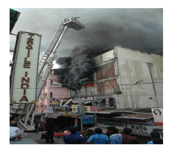
Photo shows, heavy fire, thick smoke and emission of toxic substances coming out from building. (spot photo)

Reason for lives losses: Dumping of combustible materials, heavy fire, thick smoke with toxic substances experienced, being night time all doors were locked out side both top and main entry. No possibility of escaping from the building to out side by the night shift staffs.