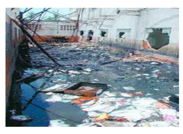
This photo shows the top floor of the building. After consuming the fire the class room partition and the roof. Here there is no door, window, proper ventilation or escape route for each class room.

Reasons for large lives losses: The fired thatched roof, class room partition thatched materials with supporting bamboo support fell on the children and blocked their movement, the smoke and consequent scramble blocked the exit routes and the stair case. The children could not make their way out, lot of suffocation children could not breathe out, within few minutes the blaze engulfed the entire floor area. The wooden materials and the note books, and dress materials play an important role for making the fire as a rapid and high intensified one.