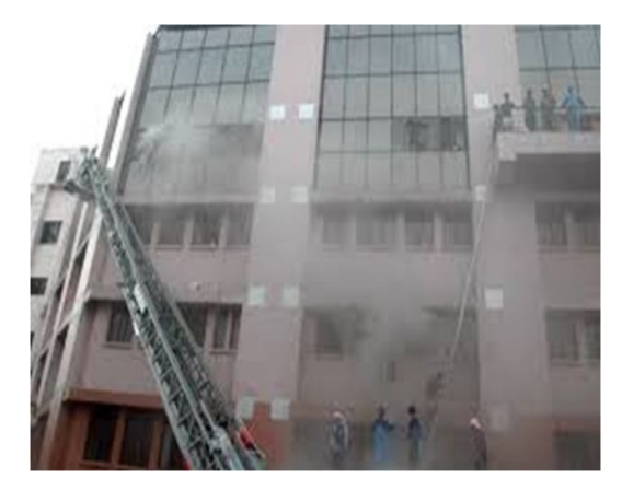
This photo shows the doors, windows and the exterior finishing are constructed by glass material. (spot photo)

Reasons for major lives losses: The cubical shape of building without ventilation the fire flame makes the building inside very hot and the smoke covered the entire building and blocked all escape routes. As a patient they cannot make their way out due to suffocation, breathing difficulty, vision obscurity.