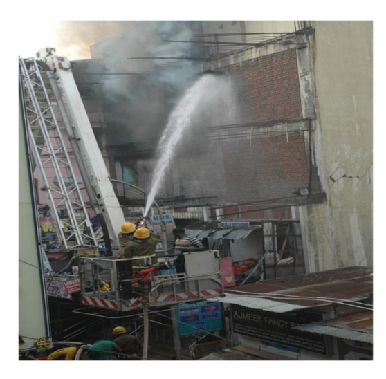
Photo shows the fire fighting operation of the professionals, the building having no site setback.(spot photo)

Failure aspects: provision of Minimum requirements fire fighting appurtenances, design of building with escape routes, site set back and approach road to the building.