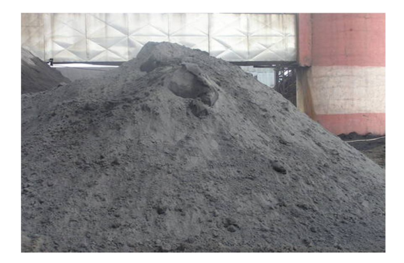
Fig 1. Fly Ash

Fly ash is defined in cement and concrete terminology as the finely divided residue resulting from the combustion of ground or powdered coal, which is transported from the firebox through the boiler by flue gases."Fly ash is a by-product of coal-fired electric generating plants. Fly ash can be used in Portland cement concrete to enhance the performance of the concrete. Fly ash is one of the residues generated in combustion, and comprises the fine particles that rise with the flue gases.