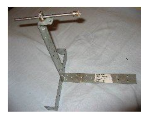
Fig.3 A special tripod

therefore it cannot be used for real time applications. Digital and video cameras can also captured palm images but can cause recognition problems.