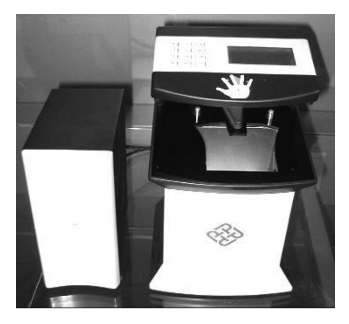
Fig.2 A CCD-based palmprint scanner