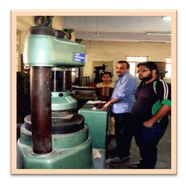
FIGURE 7: TESTING OF SAMPLE BRICKS