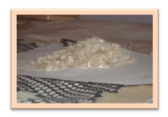
FIGURE 3: BANANA FIBRE

These fibres are extracted from the banana stem. The availabilities of this fibre from banana stem are 5 to 10%. The use of banana stem is very useful to produce paper, yarn, fabrics etc.