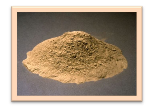
FIGURE 1: FLY ASH

particle ranging from 1 to 150 µm in diameter, of which the bulk passes through a 45- µm sieve.