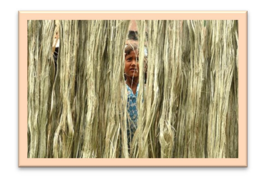
FIGURE 2: JUTE FIBRE

The fibres are extracted from the ribbon of the stem. When harvested the plants are cut near the grouted with a sickle shaped knife. The small fibres, 5 mm, are obtained by successively rating in water, see Figure-2 beating, stripping the fibre, from the core and drying. Due to its short fibre length, jute is the weakest stem fibre, although it withstands rotting very easily. It is used as packaging material (bags), carpet backing, ropes, yarns and wall decoration.