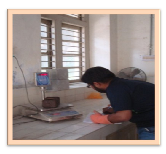
FIGURE 9: DRY WEIGHT OF SAMPLE BRICK