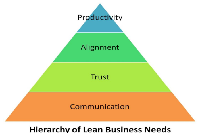
Fig,2 Hierarchy of Lean Manufaturing

Time-to-market - Time-to-market is one of the most important tools for capturing and maintaining market share. Benefits of Implementing Lean The benefits of implementing Lean can be broken down into three broad categories; Operational, Administrative, and Strategic Improvements. Even to this day, most organizations that implement Lean do so for the operational improvements, primarily because of the perception that Lean only applies to the operations side of the business. However, from our experiences, Lean's administrative and strategic benefits are equally impressive. Some of Lean's benefits are summarized below.