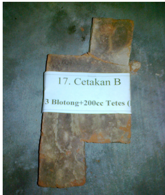
Figure 2: filter cake brick

Visual observation result can be seen in the table 3 below: