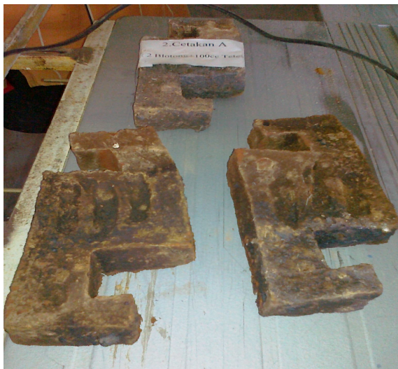
Figure 1: filter cake brick

Visual observation of the researchers did was emphasize the color ; water absorption ; swell shrinkage .