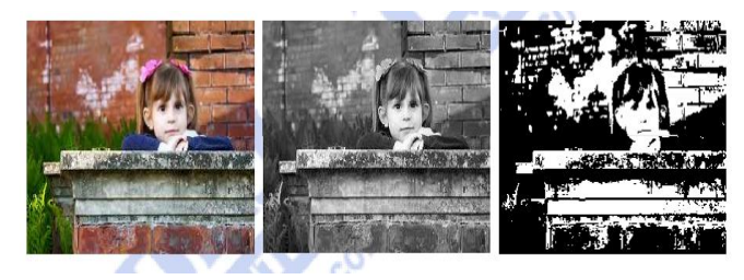
Fig. 2 Conversion of Color image to grayscale to black & white % \left( {{\rm S}} \right)