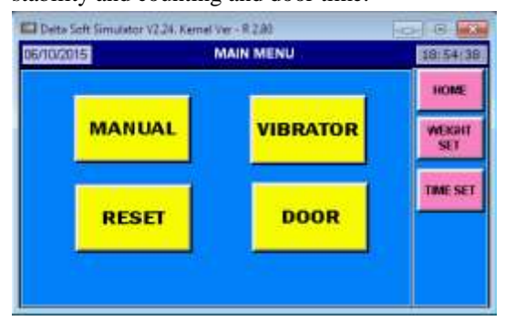
Figure 2 Output for screen 1

In industry the production speed should be high because the demand of the product is more. But when we check weight of the object manually then it will take more time for checking the weight and overall speed will decrease. So by using this food packaging machine we totally overcome the problem. The output will be displayed in the HMI. The first screen is the home page. By touching the home page, the forth coming pages are displayed. The main menu consists of different components i.e. manual, vibrator, reset door. The delta soft simulator is used., The time is set for components for calculating the working time of packaging machine. The time allocation and consumption are given for vibrator, stability and counting and door time.