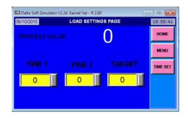
Figure 4 Output for screen 3