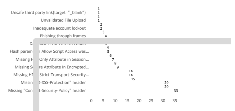
Fig. 2 Security Misconfiguration: Defect Distribution at Attack vector level

Sensitive Cookie in HTTPS Session without 'Secure' Attribute can expose cookies in plain text over an HTTP session leading to man in the middle attack. Setting the secure flag on the cookie will prevent browser submitting the cookie in any request that use an unencrypted HTTP connection.