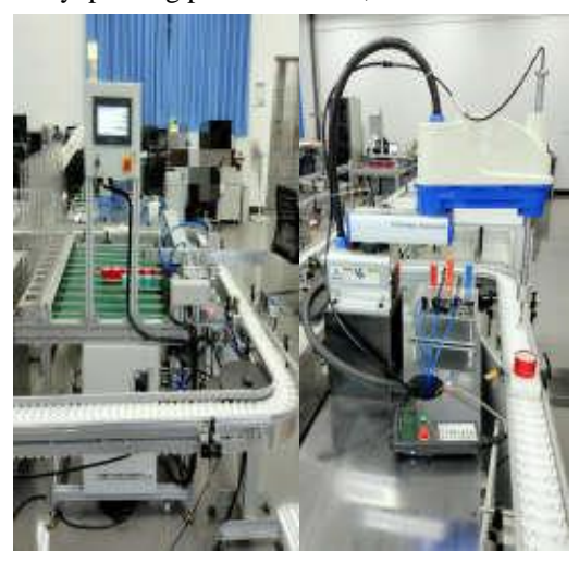
Fig C : Candy Manufacturing Smart Factory

Industry 4.0 helps in gaining efficient results taking an application from the view of intelligent manufacturing, manufacturing equipment should be equipped with the abilities of edge computing, environment perception, and coordination between equipment. The smart factory, which is a cyberphysical production system (CPPS), integrates intelligent sensors, embedded terminal systems, intelligent control system, and communications facilities. The peer to peer interaction (e.g., person to equipment, equipment to equipment, service to service) is achieved by CPPS. Therefore, building of smart factory should take into consideration manufacturing characteristics to meet rapidlychanging market needs. In the following, we use the laboratory prototype platform as an example to explore typical characteristics of smart factory. The laboratory prototype platform, which represents a candy packing production line, as shown.