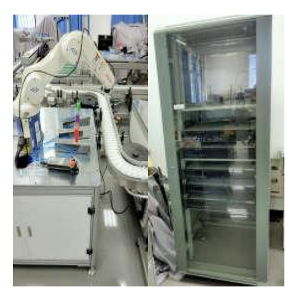
Fig D : Controller Managing the Process Flow

The basic flow of candy packing is as follows. Firstly, customers choose candy and purchase it online. Then, the order information is sent directly to the manufacturing system. Finally, the completed order is automatically transported by logistical system of smart factory. The candy packaging line has typical characteristics of smart factory, such as high interconnection, dynamical reconfiguration, deep integration, and so on.