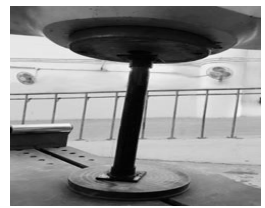
Figure 3. Compressive Test

made flat by sanding and grinding processes. Two collars of mild steel are also incorporated at the two ends of the tube for stability during the compressive load testing, as seen in Figure 3.