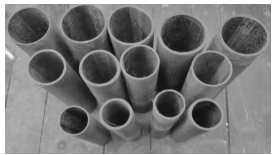
Figure 1. Hollow carbon fiber columns

Firstly, stainless steel mandrels of the required diameter are selected. These are further polished to a high degree of smoothness for better finish of the interior of carbon fiber tubes. A release film is tightly wound around the mandrel for easy release of the cured tubes. For hand lay-up, the carbon fiber piece is cut according to the number of layers required and diameter of tube. The epoxy-hardener mixture is prepared by mixing them in the ratio of 1:3 respectively. The carbon fiber is weighed and an equal weight of the epoxyhardener mixture is then applied to the carbon fiber using roller brushes. The wet carbon fiber is then wound on the mandrel firmly. The mandrel is further rolled on a smooth clean surface to further tighten the fiber and spread the resin evenly. A single layer of perforated release film is then wounded over the carbon fiber surface with minimal overlapping. The purpose of this film is to ensure smooth finish and release the excess resin to the breather through perforations. Over the release film, a layer of breather cloth is added whose purpose is to absorb the excess epoxy in the fiber. The preparation is then vacuum packed using a pressure pump and left for a curing period of 48 hours. The vacuum pump should be evenly spread across the tube circumference for even pressure it.