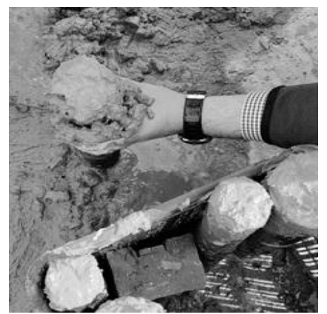
Figure 2. Filling of concrete