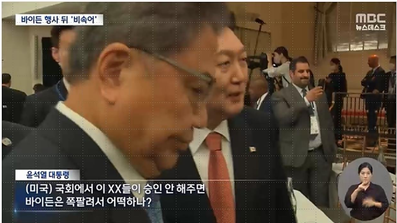
September 22, 2022 MBC News Desk video screen capture photo material <Report that President S-Y Yoon... made a remark containing profanity while leaving the event after meeting with President Biden>

President Joe Biden and the US Congress. It was reported through an MBC article dated September 22, 2022, that he used non-slang, referring to President Biden. In addition, it did not stop at just reporting but also sent such content to the White House in the United States by e-mail. However, as a result of listening to President Yoon's remarks at the time of the speech research professor at Seoul National University and Soongsil University Sound Engineering Research Center at the time, he did not say anything like 'US' or 'Biden', and President Yoon's remarks said, "What if these XXs don't approve in the National Assembly and if they blow away <Korean word: Nal-li-myun>?" Nevertheless, from the daytime news that day, MBC continued to broadcast-related news with subtitles such as "If these XXs do not approve in the (USA) National Assembly, Biden will be embarrassed?" In the subtitles, parentheses were used to add the word 'USA', which was not even in the remarks, forcibly portraying it as if it were a remark directed toward the United States. MBC said that President Suk-yeol Yoon said 'National Assembly' in his remarks, but MBC manipulated it by adding the word 'US' in parentheses, knowing that in the United States, a place that plays the same role as Korea's 'National Assembly' is called 'Congress' in America.