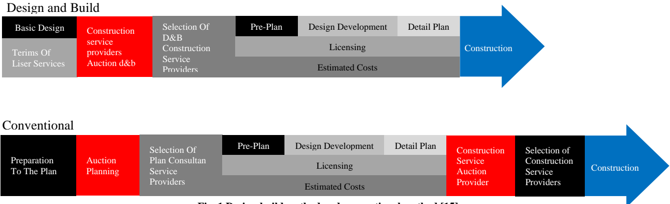
Fig. 1 Design-build method and conventional method [15]