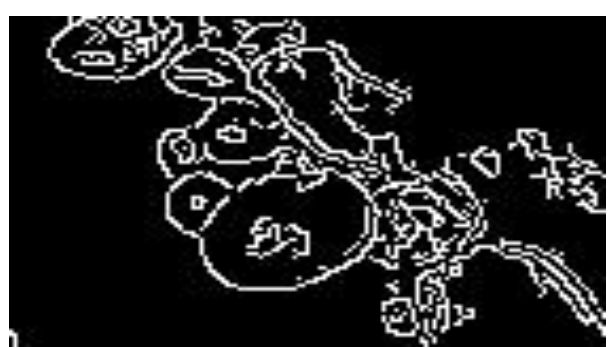
Fig 2: Output from Edge Detection

Consistently, edges are opposite in gradient direction, which is tuned to 1 of 4 points addressing vertical-level & 2 inclining headings.