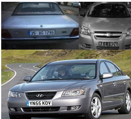
Fig. 2 The Vehicle Input Image

Localization of accurate License Plate regions from vehicle images is one of the most important and difficult tasks because each vehicular image differs in large variations in quantity, color, size, texture, font, shape, occlusions, patches and spatial orientations or inclinations of the License Plate regions within them. The variations of the environmental conditions also cause difficulties in the License Plate Localization. The main challenges include non-uniform outdoor illumination conditions, speed and motion of vehicle, stationary backgrounds, presence of noise, blurring in the image, shadows, bad weather conditions (wind speed, pollution levels and foggy conditions) etc.