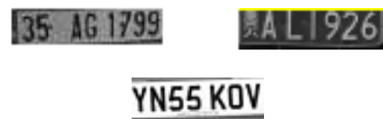
Fig. 4 The Extracted License Plates

The rest of this paper is organized as follows. The Section II constitutes a literature review of License Plate Localization. The comparison results of the review are given in Section III and finally, conclusions as well as future directions are summarized in Section IV.