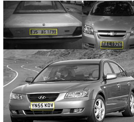
Fig. 3 The License Plate Localization