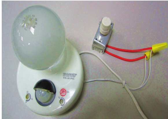
Figure5.1. Lighting module implemented with the PIR sensor and the lamp

The PIR sensor detects the approach of the visitor and then the relay circuit turns to the ON state. The lighting works in the maximum intensity mode which consumes over 300 mA of current