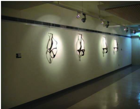
Figure 2.1 Lightings are in the exhibition space

The PIR sensor can detect the approach of the visitor. The lighting controller is designed to receive the information of the visitor's approach and then turn the lighting or lightings into the normal working mode to illuminate the exhibition to the expected brightness. Meanwhile, the information of the visitor's approach in front of the lighting is sent up to the lighting network with an ID of the lighting controller attached. This information will be collected by the master computer connected with the lighting network through the network interface circuit. It is useful in the assistance of the exhibition security. All the lighting controllers in the lighting modules are equipped with the energy-saving function. It will automatically turn the lighting into dimming level to save electric power in few seconds after the visitor leaving the lighting.