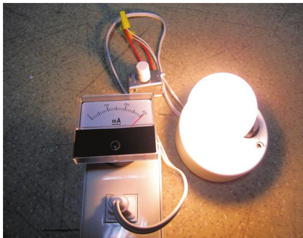
Figure5.2: The lighting works in the maximum intensity mode when the visitor approached. The measured current consumption is over 300 mA.

The test of the lighting module after the visitor leaves. The PIR sensor is covered by a box to simulate the leave of the visitor. The relay circuit turns to the OFF state.