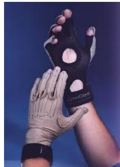
Fig:2 Glove based gestural interaction

The HCI interpretation of gestures requires that dynamic and/or static configurations of the human hand, arm, and even other parts of the human body, be measurable by the machine. First attempts to solve this problem resulted in mechanical devices that directly measure hand and/or arm joint angles and spatial position. This group is best represented by the so-called glove-based devices [8], [9], [10], [11], [12].