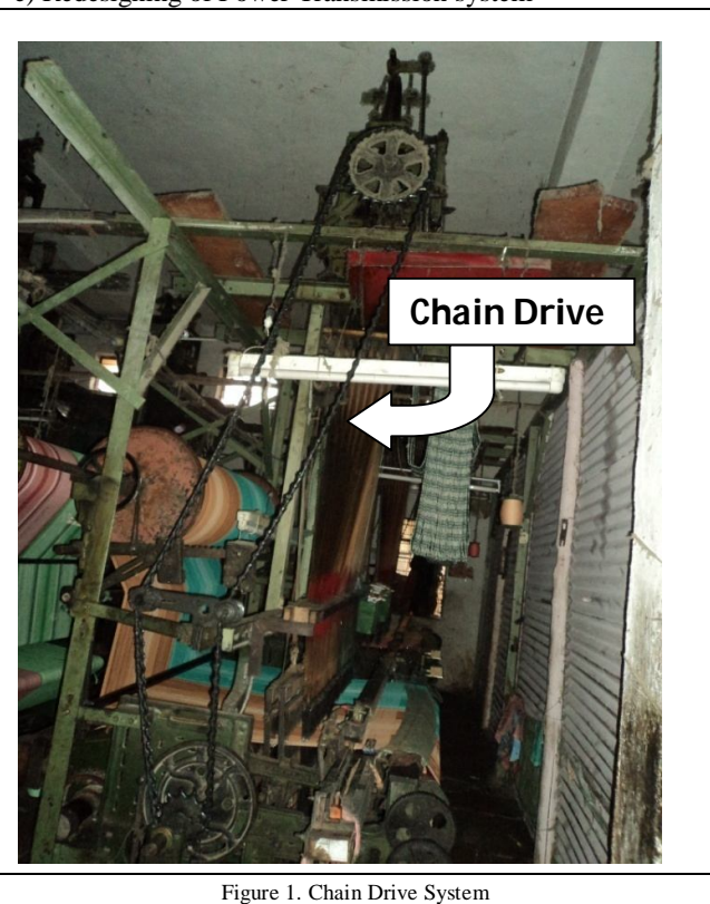
Figure 1. Chain Drive System

As discussed above the problems of chain failure jerky power transfer vibrations can be addressed to the long length of chain used for jacquard movement. This problem is dominantly due to longer centre distance of driver and driven shaft and sagging of the chain, frequent lubrication is also required for this drive system.