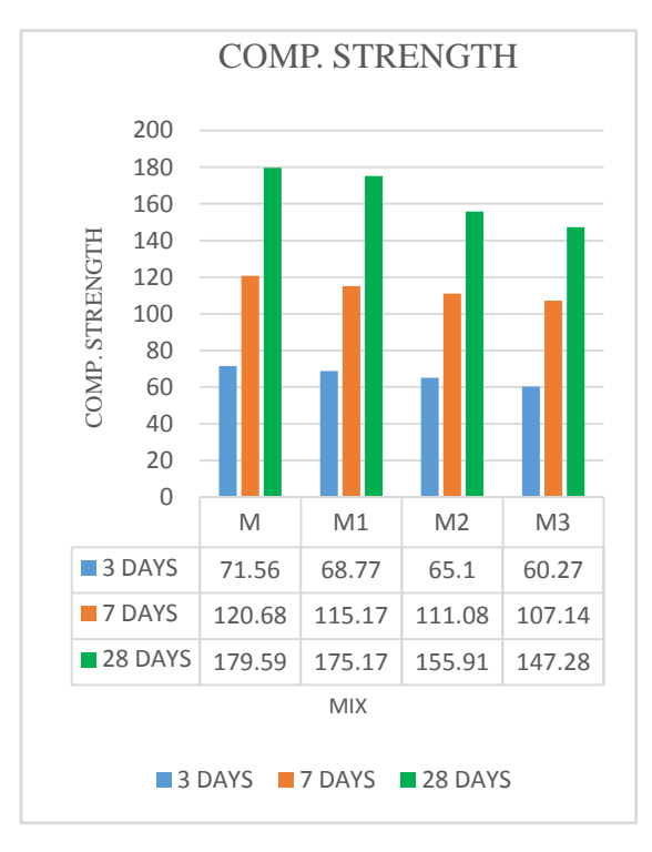
Fig-1 graphical presentation of comp. Strength

From the above table percentage variation in strength of 10% replacement is 2.46%. In comparison of 0% replacement of fly ash. It is reduced up to 13.19% when fly ash replaced by 20%.