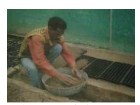
Fig. Manual seed feeding process.

The half of box is filled by coco peat powder thoroughly in all he holes, after completion of near about 9 to 10then all these boxes are put one over another and pressed so that all holes are filled to half of size after that seed are put one by one in these holes by the labours. After putting seeds in the holes of the box again coco peat powder is put in the box and excess amount of powder which will remain in the box is removed.