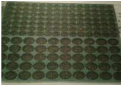
Fig. Completion of seed feeding process.

The time required for this process is 3 to 4 minutes for 9 to 10 boxes. Then after completing all the process the tray is kept in proper environment and water is being fed when required. The sufficient height of plants in the tray will grow then it is supplied to customers.