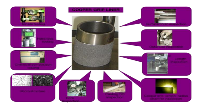
Figure 2: Inspection & Testing Techniques.

Inspection of liner carried out to check its acceptability those are Hardness testing - Hardness of w/p can be checked on hardness testing machine HRB/HRC/BHN.