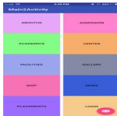
Fig 2: Home page