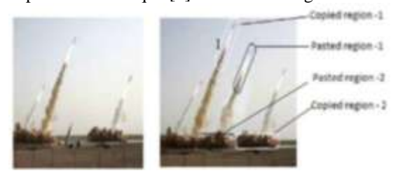
Fig 2: Example of image tampering which shown in press in July 2008 in which lower image display four successful missiles which are forge.

compressed copied area and resampling tools include scaling and rotating the image which increases even more difficulties to detect forgery attack. This is a particular type of image manipulation technique [3] as shown in Fig. 2