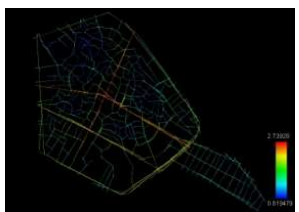
Fig.6 Integration graph of Koya city in 1940

The analysis of this phase shows that the integration node (the most integrated and less isolated spaces) is located in the center of the city represented by the main spaces linking the four neighborhoods with each other where the main market is located. While the isolation node (the less integrated and deeper spaces) was found in the center of each neighborhood represented by the more private residential areas. And Fig.6 represents the Integration graph, while Fig.7 represents the Mean Depth graph. The values are represented using gradients from red to blue, where red represents the highest values, while blue is the lowest value.