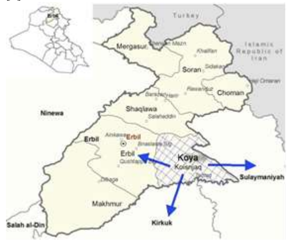
Fig 1. The location of Koya city in Kurdistan Region