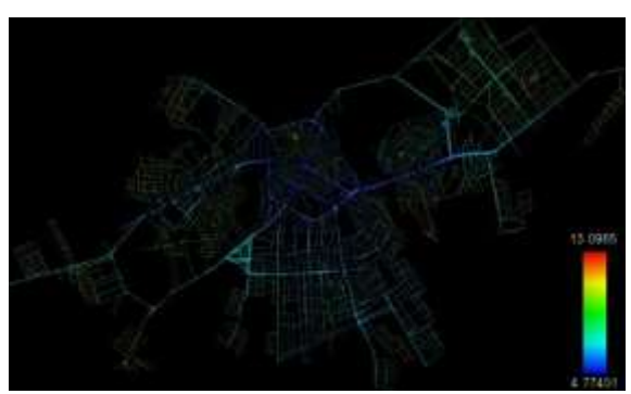
Fig.11 Mean Depth graph of Koya city in 2013

The analysis of the city's plans at this phase showed convergence in the values of integration as well as the depth values, especially in the new areas on the north-eastern and southern axes. This indicates a regression of the hierarchy of spaces because of the grid system planning of the new areas that have emerged because of the university. It is also possible to see the difference between the nature of the spatial configuration of the old part of the city and the new areas. And Table III shows Integration, Connectivity and Mean Depth's values in this phase.