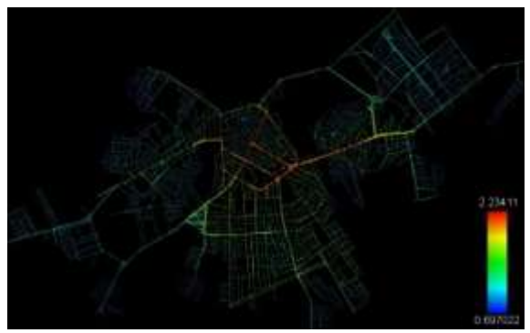
Fig.10 Integration graph of Koya city in 2013

This phase is ten years after the establishment of Koya University, where the growth of the city has increased significantly in two main directions. One to the northeast of the city towards the university, and the other to the south, where another educational institution is located, which is the Koya Institute. The number of spaces at this stage reaches 2063 spaces. At this stage, although the integration node remained in the old city center, other high-integration spaces emerged outside the city center especially the axis leading to the university, as shown in Fig.10, which represents the Integration graph and the Fig.11, which represents the Mean Depth graph.