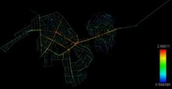
Fig.8 Integration graph of Koya city in 2003

At this phase, the city grew to the south as well as to the north-east along the road leading to Sulaymaniyah city, although more than 60 years have passed since the first phase, this growth has been relatively slow where the number of spaces analyzed was only 1004 spaces. At this phase, the integration node remained in the center of the city, and it extended to the north-east, while the isolation node remained in the residential areas inside the old neighborhoods. And Fig.8 represents the Integration graph, while Fig.9 represents the Mean Depth graph.