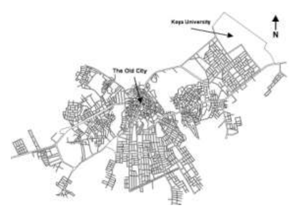
Fig 4. Phase 2 Koya city in 2013