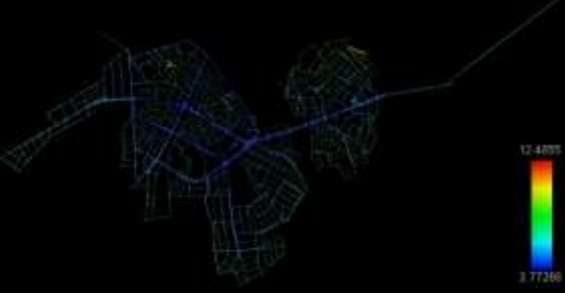
Fig.9 Mean Depth graph of Koya city in 2003

Table II shows Integration, Connectivity and Mean Depth's values. These results are close to the results of the first phase. The hierarchy can also be seen in these values, and the depth of the space has increased in the middle of the old residential areas, which indicates that the city has maintained its traditional character.