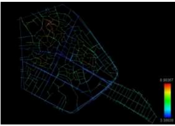
Fig.7 Mean Depth graph of Koya city in 1940

The number of analyzed spaces was 552 spaces and Table I shows Integration, Connectivity and Mean Depth's values. A relative gradation of these values can be seen from the highest to the lowest and