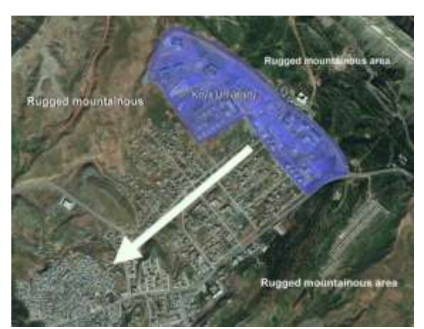
Fig 5. The location of Koya University at the foot of the mountain

Koya University was founded in October 2003 and currently has 4 faculties consisting of 25 departments. The University Complex is located at the foot of the Haibat Sultan Mountain, northeast of Koya, 3 km from the city centre [7]. As shown in Fig. 5, the University is surrounded by a rugged mountainous area from three sides, which means that the city can only grow in one direction.