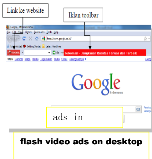
Figure 2. ad impressions on the Desktop

On the basis of this experience we are trying to assess how much the influence of promotion with views on a computer connected to the Internet to the perception of the marketed product. The network model of ad impressions as follows;