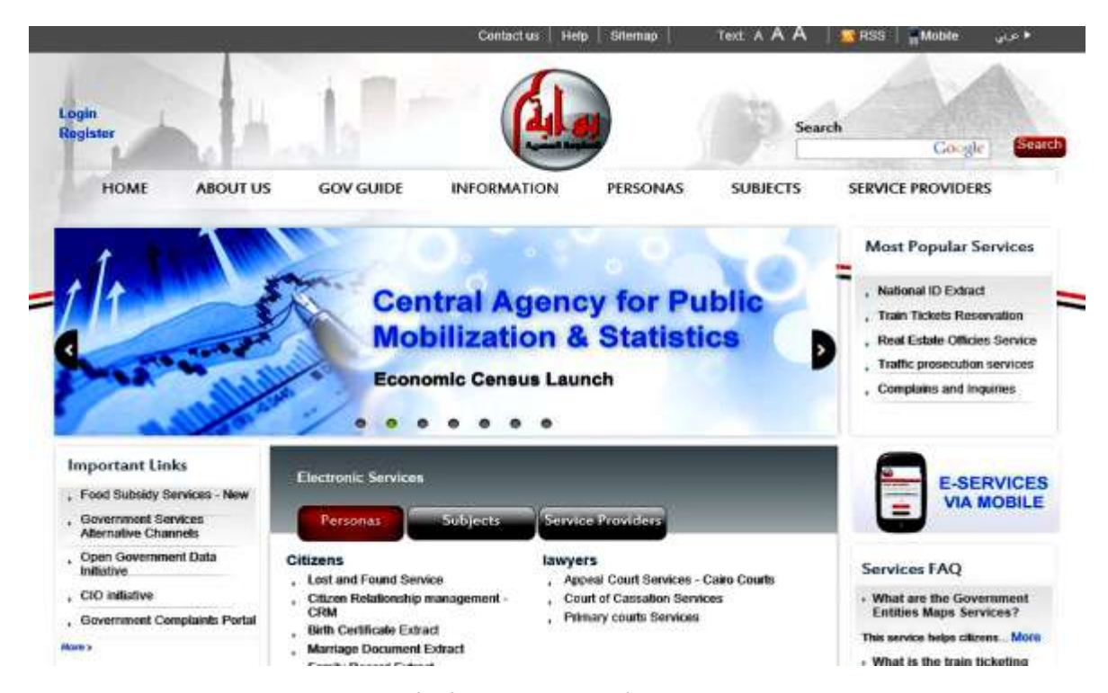
Fig. 2: E-government in Egypt