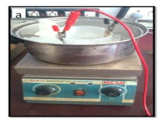
Fig.1 Electro Chemical Machining Setup

a) The initial weight of anode is measured in grams by Schimadzu microbalance. Titanium is masked on all sides except for a square centimetre area by a Lacquer.