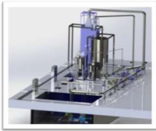
Fig 1 : 3D Drawing of Flow Meter Calibration System for covering Meter Sizes upto DN 300.