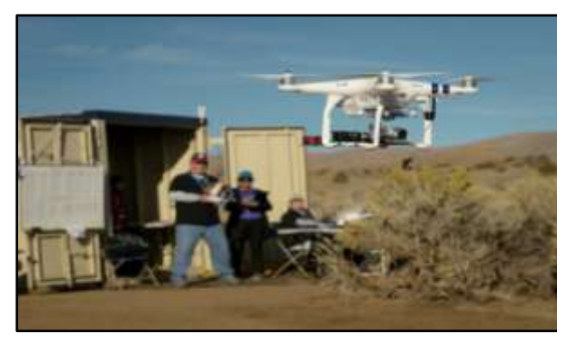
Fig 1. Drone surveying

A. Drones: Advanced Mapping and Scanning Capacities for More Accurate Visualizations