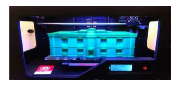
Fig 2.3D Printing

3D printing is gaining a lot of scope in construction industry not just creating a model, but also in business - and with 3D printers coming down in price each year, it's not long before we'll see them used in civil engineering. 3D printing offers benefits for both design and construction, with 3D printing, it's easy to design custom and creative construction supplies and then build them using nearly any kind of material imaginable. In fact, 3D printers are already in use in construction projects in Europe. Dutch construction company Heymans – most well-known for its "smart highway" and its glowing bicycle paths, which use luminescent paint to clearly mark road lanes at night – has created the world's first 3D-printed bridge. The bridge, which was first designed in October 2015, will span across the Oudezijds Achterburgwal canal when it is completed in 2017.