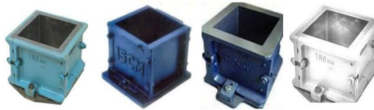
Figure 2: 150mm x 150mm x 150mm moulds

where P = Test Load (KN) and A = section area normal to P