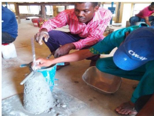
Fig. 3: Slump Testing

In order to measure the consistency and to check the workability of fresh concrete before it sets, slump test was carried out in accordance with BS EN 12350-2. Slump cone specimen was cast for each concrete mixture and the slump or reduction in height of the cone is considered a measure of workability. The average compressive strength by 14% average. While the series with superplasticizer: cement ratio of 5: 50 increased the average compressive strength by 10% average.