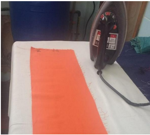
Fig. 4: Final drying process of the samples.

To finish the tests, an iron was used to follow the drying process of the samples. Fig. 4 illustrates this step.