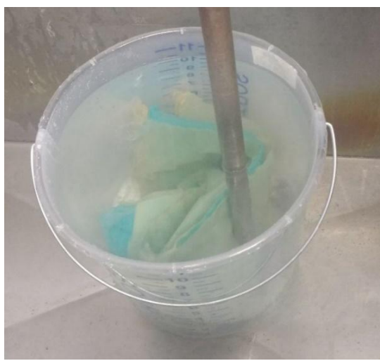
Fig. 2: Washing of tissue samples.

After dyeing, the samples were allowed to stand for a period of 16 hours in a dry and out-of-light place. The next step was to wash the tissues to remove the chemical excess. Fig. 2 illustrates this step.