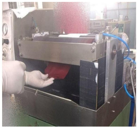
Fig. 1: Dyeing the sample in the foulard.

The next step was to dye the fabric in the foulard, as shown in fig. 1.