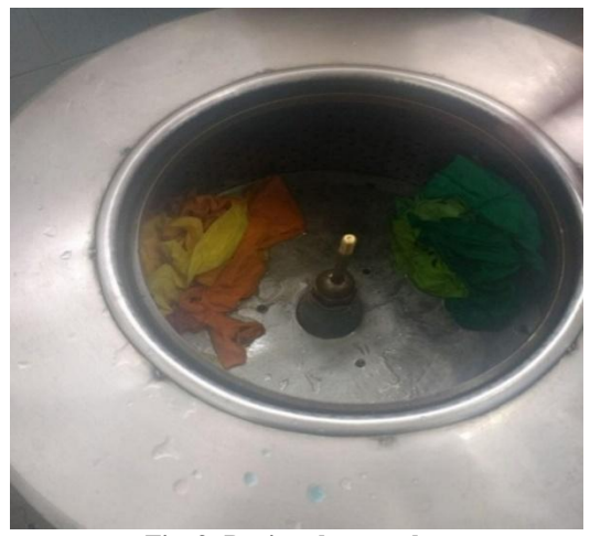
Fig. 3: Drying the samples.

After washing the samples were placed in a dryer to remove excess water, as shown in fig. 3.