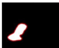
Fig 4: Foreground Mask

A noise cancellation filter is needed to improve the candidate foreground mask based on information obtained from background image subtraction, as we eliminates noise that do not correspond to actual moving objects, by applying median filter [11], as shown in Fig 4.