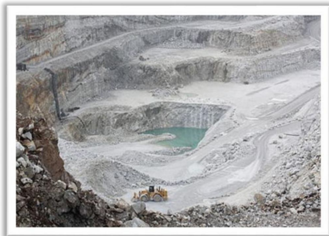
FIGURE 3.3 Limestone quarry