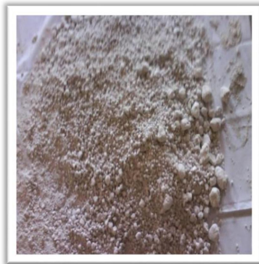
FIGURE 1: Hypo sludge