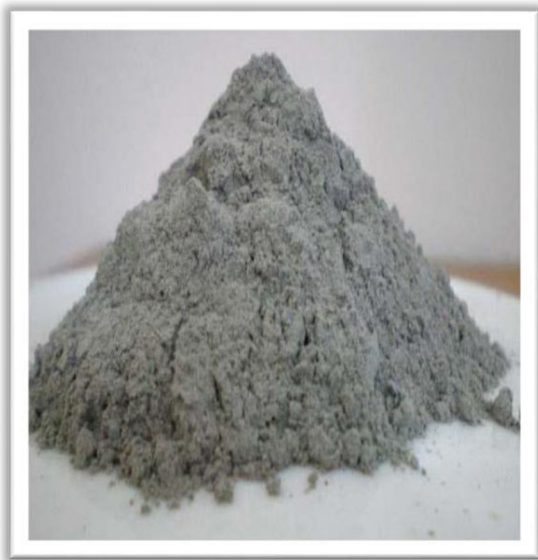
FIGURE 2: Fly ash (Class F)

The burning of harder, older anthracite and bituminous coal typically produces Class F fly ash. This fly ash is pozzolanic in nature, and contains less than 20% lime (CaO). Possessing pozzolanic properties, the glassy silica and alumina of Class F fly ash requires a cementing agent, such as Portland cement, quicklime, or hydrated lime, with the presence of water in order to react and produce cementitious compounds.