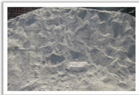
FIGURE 3 Quarry dust

Quarry dust is a waste product produced during the crushing process which is used to extract stone. It is rock particles. When huge rocks brake in too small parts for the construction in quarries. It is like sand but mostly grey in